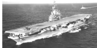
USS Oriskany 1950-1994 Photo from December 6, 1950 Outside New York City